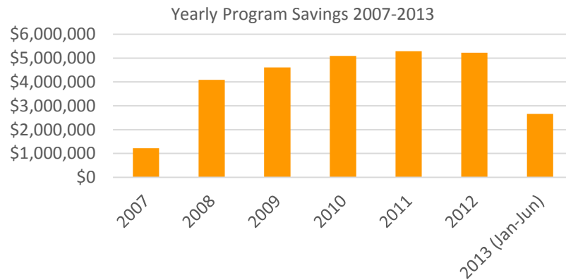
Figure 16 - System Wide Program Savings since July 2007

Notable accomplishments in the program for FY13 include: